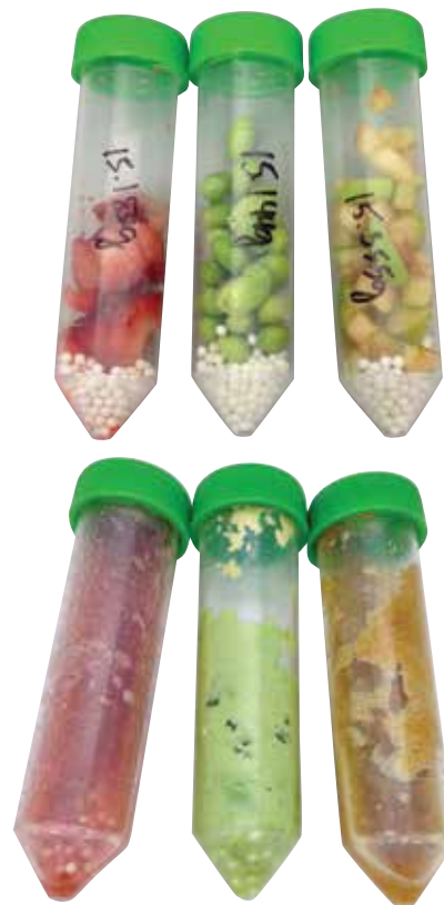
Figure 1 Produce Samples Pre and Post Homogenization. 15 g samples of strawberry, soybeans, and apples were homogenized on the Bead Mill 24 with 15 g of ceramic beads in 30 seconds.

Post processing, the samples were visually inspected and determined that complete homogenization was achieved (Figure 1).