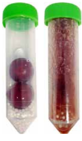
Figure 1 Grape sample pre and post homogenization

J. Wong et al, Development and interlaboratory validation of QuEChERS-based liquid chromatography-tandem mass spectrometry method for multiresidue pesticide analysis. J. Agric. Food. Chem. 2010, 58, 5897-5903.