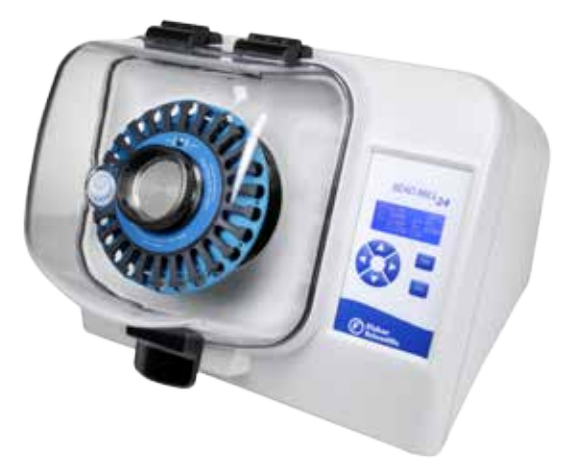
Bead Mill 24: (Cat #15340163)