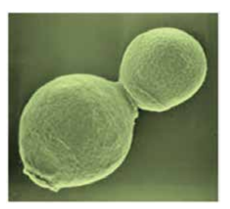
Figure 1 Budding Yeast

Bead mill homogenization offers a robust and quick method for disrupting yeast cells. Bead mills are particularly attractive because of the automated nature of their operation, eliminating variation caused by human error. Their ability to process a large number of samples at once eliminates sample processing bottlenecks, creating the potential for high throughput studies. Bead mill homogenization provides researchers with a rapid, efficient, and reliable method for disrupting yeast