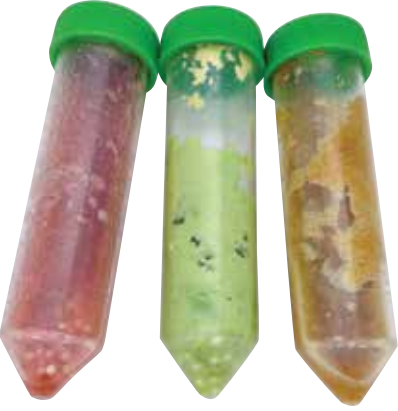
Figure 1 Produce Samples Pre and Post Homogenization. 15 g samples of strawberry, soybeans, and apples were homogenized on the Bead Mill 24 with 15 g of ceramic beads in 30 seconds.