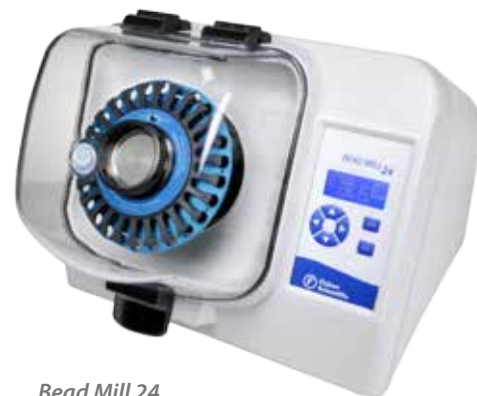
Bead Mill 24