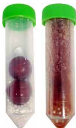
Figure 1 Grape sample pre and post homogenization